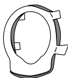
Dust Seal Washer Complete (152988-1)

Dust Seal Washer Complete has been added here.